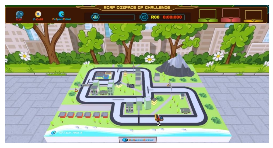
Figure 2: CoSpace Grand Prix Challenge (iCooL), FirstSteps U12

In the CoSpace Grand Prix Challenge (iCooL), students are only required code a virtual robot, and finally take part in the Grand Prix Challenge (iCooL). The maximum stay in virtual world is 8 minutes.