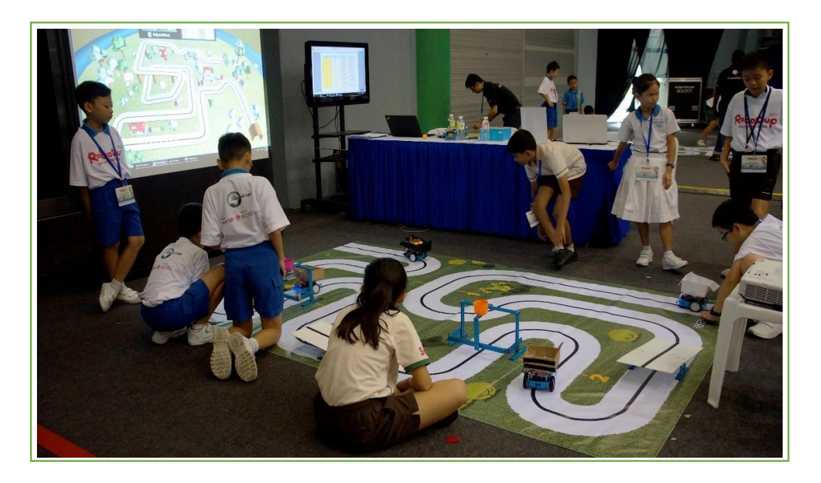
Figure 1: CoSpace Grand Prix Challenge

The CoSpace Grand Prix Simulator is the only official platform for the CoSpace Grand Prix Challenge. This simulator allows programs to be developed using a graphical programming interface (GUI) or C language. The same program for the virtual robot in the virtual environment can be downloaded on to a real robot in the real environment. Participating teams can contact support@cospacerobot.org for CoSpace Grand Prix Simulator download, help and assistance.